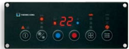
ClimaAire I D