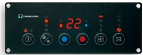
ClimAire I D